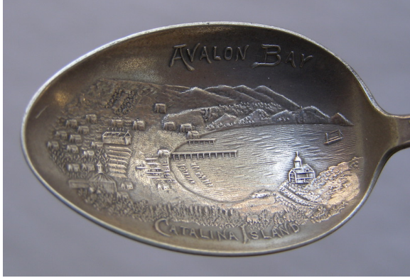
Mayer Type 2

Exhibits a slightly more engraving-like than photographic appearance. Shows the pre-1909 single pier along with the smaller western pier associated with the Bath House. The Dance Pavilion and auxiliary tent are shown in the left foreground. A simple box-like Hotel Metropole is shown with a plain roofline. The Sugarloaf Point configuration is ambiguous.